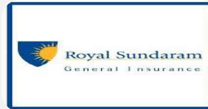
Royal Sundaram Alliance