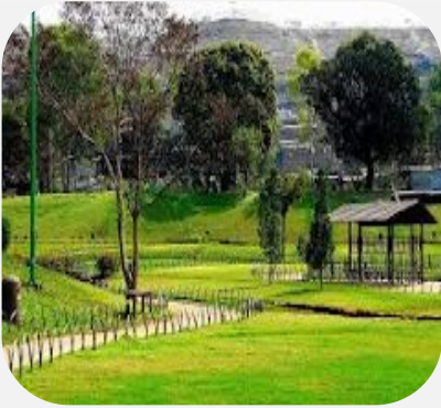
Pune Okayama Friendship Garden

Pune Okayama Friendship Garden is the largest Japanese garden outside of Japan, in Asia. Also called the Pu. La. Deshpande Udyan, it was named after the famous Marathi writer and humorist, Pu La Deshpande who received the Padma Bhushan in 1990. This garden reflects on the Indo-Japanese relationship, as it is inspired by the 300-year old Okayama Korakuen Garden in Japan