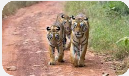
Tadoba National park

454 kms from Pune - Goa, though carrying a rich colonial past, has attained fame as India's centre of international tourism. Its present culture still reflects the association to its multi-cultural roots in the form of many churches, temples and synagogues that are located here. However, with the younger crowd it is renowned as the destination to go to for a fun-filled and partying getaway.