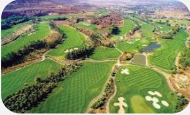
Oxford Golf Club Pune:

Oxford Golf Club Pune: Voted as one of the Top Golf & Leisure Destinations in India, it boasts of Pune's only 18 hole private golf course, Leadbetter Golf Academy, an all-suite hotel, and leisure sports facility set amidst 136 acres, with close proximity to Pune.