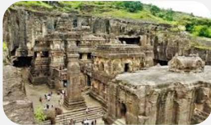
Ajanta and Ellora Caves

213 kms from Pune - A popular and favored weekend getaways near Pune, Nashik is the largest city in Northern Maharashtra and the third largest district in the state. It is situated on the banks of the River Godavari and is the highest producer of onions and grapes in the country. It also has bagged the title for being the Most Tourist Friendly City in India and hence attracts innumerable tourists from all over the country and the world. This city is called the 'Wine Capital of India' due to its flourishing wine industry.