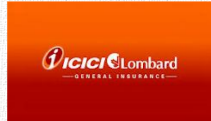
ICICI Lombard General Insurance