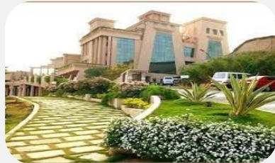
The Corinthian Club

Address: Mumbai, Pune Bangalore Highway Pashan Exit, Lavale, Maharashtra 411045 Website: https://www.oxfordgolfresort.com/