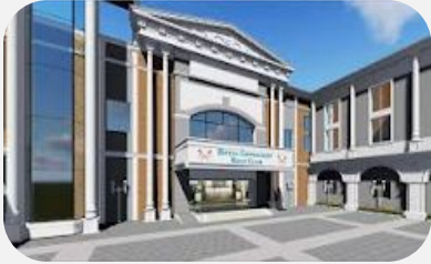
Royal Connaught Boat Club

Royal Connaught Boat Club: Located on the enchanting banks of rivers Mula & Mutha, the Royal Connaught Boat Club was established during the second half of 19th century. The Club is known internationally and is one of the oldest institutions with a royal lineage. Website: http://www.boatclubpune.com