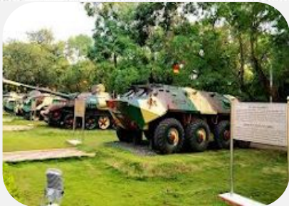
The National War Memorial

Khadakwasla Dam is a dam on the Mutha River 21 km from the centre of the city of Pune. The dam created a reservoir known as Khadakwasla Lake which is the main source of water for Pune and its suburbs. In the vicinity of Khadakwasla Dam is the National Defence Academy (NDA), the Defence Institute of Advanced Technology, the College of Military Engineering, Pune and Central Water and Power Research Station.